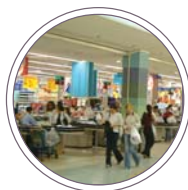
Retail chains, shopping malls