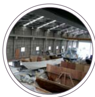
Shipyards, Construction Sites