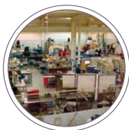
Industrial Sites, Production Facilities