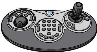
KBD5000 Jog/Shuttle, Keypad, and Joystick