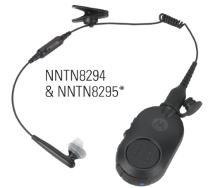
NNTN8294 & NNTN8295*

Bluetooth 2.1 audio is embedded in the radio enabling fast and secure pairing with a variety of Bluetooth accessories. Easy to attach and pair, Motorola Solutions Bluetooth accessories enhance performance and security wherever you work. Officers can talk discreetly undercover, move without wires and use their radio like never before.