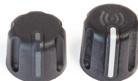
Standard Control Knob RFID Control Knob

Optional colour identification bands for groups with different tasks, coverage areas or shifts