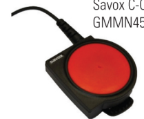
Savox C-C400 GMMN4579A

Complete the solution with the Savox C-C400 com-control unit that enables the use of your two-way radio in hazardous conditions. Designed to be especially robust for the most extreme environments, the extra-large push-to-talk button ensures transmission even when used underneath gear and protective clothing.