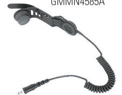
Savox HC-1 GMMN4585A

Complete the solution with the Savox C-C400 com-control unit that enables the use of your two-way radio in hazardous conditions. Designed to be especially robust for the most extreme environments, the extra-large push-to-talk button ensures transmission even when used underneath gear and protective clothing.