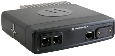
ETHERNET EXPANSION HEAD 2X STD, ETHERNET TYPE, ETHERNET SIM READER AND RS232