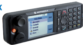
REMOTE CONTROL HEAD