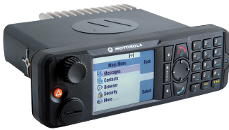
DASH / DESK CONTROL HEAD