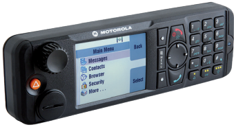
REMOTE ETHERNET CONTROL HEAD (ReCH) SUPPORTS EXTERNAL SPEAKERS AND PTT