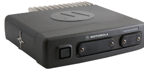
EXPANSION HEAD ENHANCED STD AND AUXILIARY 25 PIN AND RS232