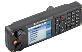
IP67 CONTROL HEAD