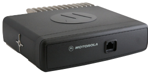
EXPANSION HEAD SINGLE STD CONNECTION