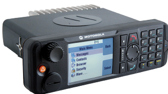
DASH MOUNT CAR, TRUCK