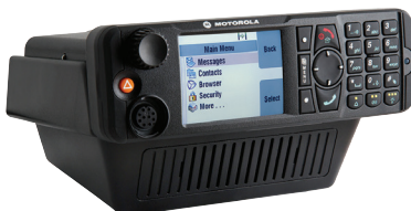
DESK MOUNT CONTROL CENTRE