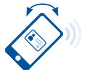
Twist & Go